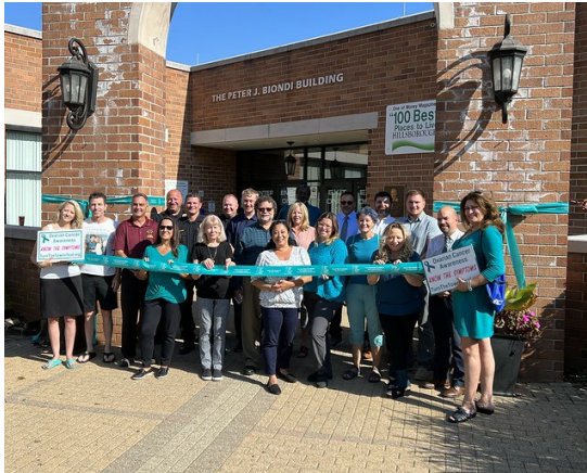
Pictured: Hillsborough employees tie teal ribbons on trees at the Municipal Complex to commemorate Ovarian Cancer Awareness Month.