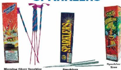
Sparkling Devices: MORNING GLORIES

CAUTION: FLAMMABLE USE ONLY UNDER CLOSE ADULT SUPERVISION. FOR OUTDOOR USE ONLY. DO NOT TOUCH HOT WOOD. HOLD IN HAND WITH ARM EXTENDED AWAY FROM BODY. KEEP BURNING END OR SPARKS AWAY FROM WEARING APPAREL OR OTHER FLAMMABLE MATERIAL. HOLD AND LIGHT ONE DEVICE AT A TIME. AFTER USE PLACE WOOD IN WATER.