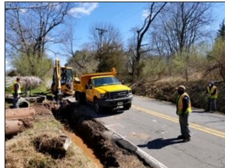
Department of Public Works: