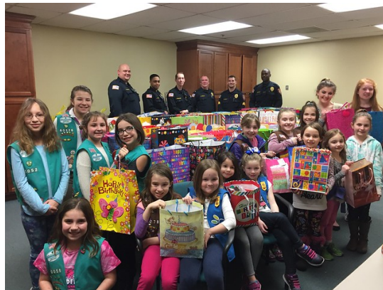
Pictured: Members of the Hillsborough Police Department and Girl Scouts from Troops of Hillsborough Service Unit 72

Birthday bags are a special something extra that families with young children of CAN receive when it is the birthday of a child in their family. These bags include cake mix, icing, fun & festive plates, party hats, favors, anything to make a child's birthday fun and special. On Monday March 12th, the 106th birthday of the Girl Scouts organization, the members of the Girl Scouts SU72 and the PBA 205 excitedly gathered together to present the bags to the Social Services department.