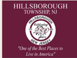
18"x24" Lawn Signs $15